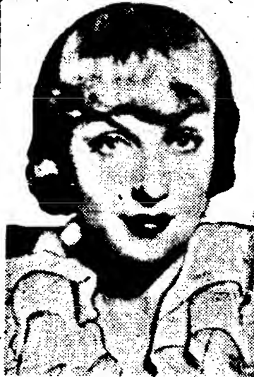
CAROLE LOMBARD Boosts a Friend

... Snapshots of Hollywood Collected at Random: Bob Burns, of 11 people, going scientific on us studying tadpoles and what not under a microscope; George Brent nothing if not a time traveler—he dashes to the studio